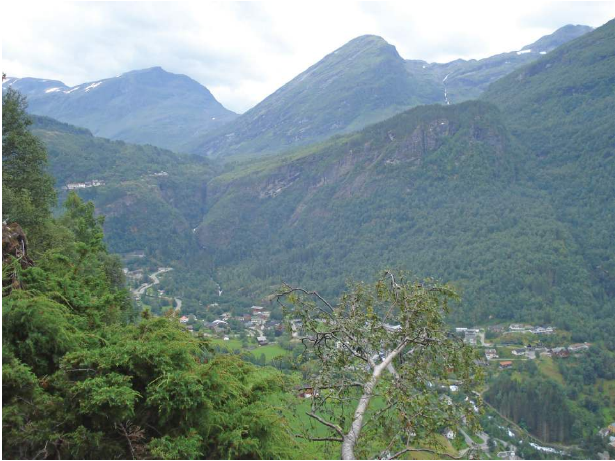
Fig. 1.2 for Question 1